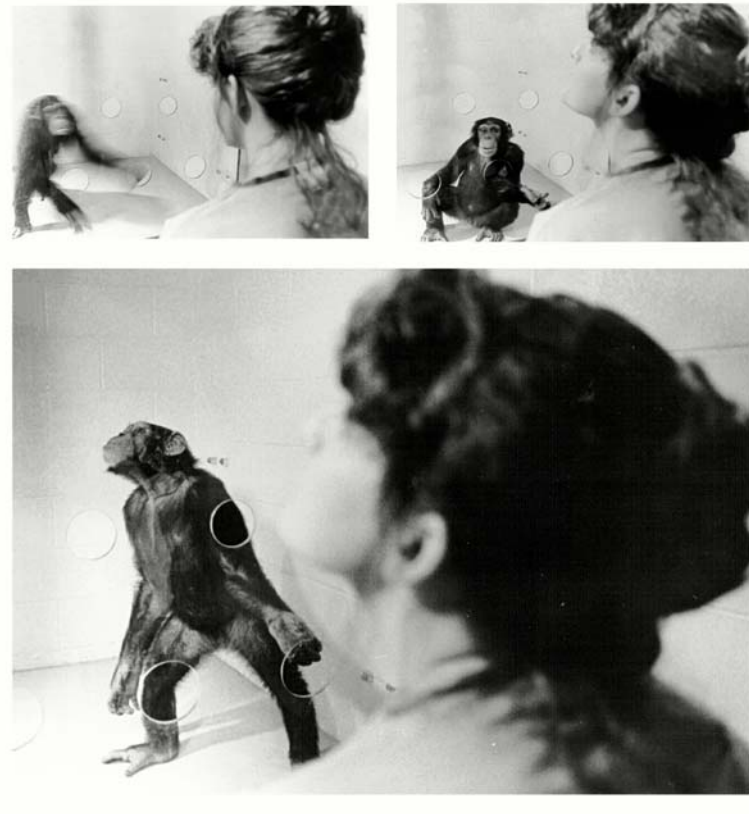
Figure 1. Gaze-following in a 5-year-old chimpanzee.